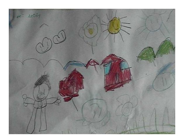
Figure 2. Mixed by a child under displacement situation. Untitled

Figure 2 shows that there are images loaded with expressive graphisms, where there are no visual element directly recognizable, a composition very rich in plasticity, movement and color, there is constant and dynamic hooking, which from its anarchy in handling the line offers richness in its visual force; color selection maintains a strong tension of harmony, when the various warm tones and the various cold tones coordinate, which is combined thanks to the contrast by the black of the ink, and white of the support. Therefore, Garcia holds that: