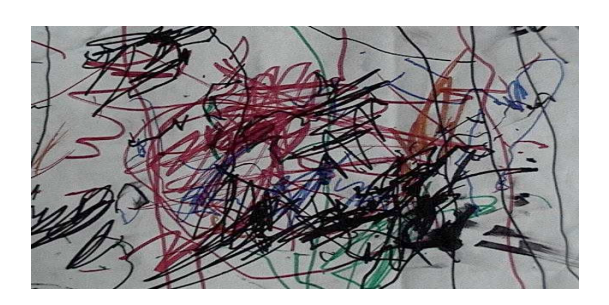
Figure 1. Mixed by a child under displacement situation. Untitled

This drawing expresses handling human figure, within a surrounding, perhaps the one related to origin place, the yellow sun, and a colorless sun, the red house and a red rose contrast to the other figures, including the human one, which is colorless, the red color as that meaningful thing which still lives, either from experience or memory, that thing that denies to remain behind; the human figure, on a first plane, draws a diagonal toward mountains, creating a depth sense as present-past relationship, as if it were the connection of one consequence of displacement, perhaps expressing a moving away, since he turns his back. Regarding it, Cuenca states that: "Reality always remains encoded, exposed to interpretation, and error by it, articulated into a game of mirrors which raises duality or ambiguousness of every sense" (Cuesta, 1999:24).