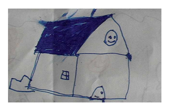
Figure 3. Mixed by a child under displacement situation. "house"

The interesting thing of this figure, is inclusion of sensation of depth, given by its redimension, it does not appear as a plane element, the window that smiles, gives the impression of being a humanized object; its small door with a safe, the lateral window, the sensation of floor and bush given by the double line, makes it to value in the drawing inclusion of details, which seems not to be proper at that age. At observing it, loneliness feels dramatic, not tragic, even, in spite of the smile of the window ... the cold color, line handling transport homesickness, not of what it was, but what it could have been. As Barthes states: